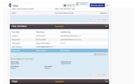
Screenshot 2023-09-04 at 4.45.16 PM.png 302K

CCC DomRelCR2108 (Chief Judge's Office) <Ccc.Domrelcr2108@cookcountyiil.gov>