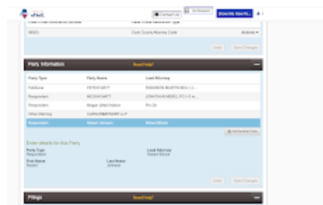
Screenshot 2023-09-04 at 4.45.16 PM.png 302K